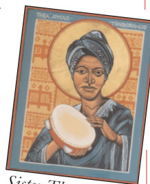
Sister Thea icon