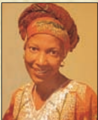
Sister Thea Bowman