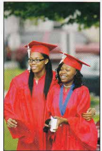
Another great year - 2016 graduates! Off to attend Catholic High School.