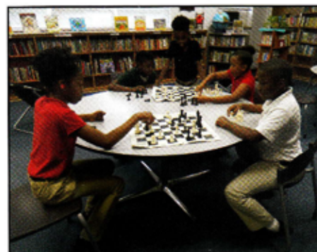
Students enjoy playing chess in our after school program.

Our Extended Day after school program was enhanced when the Chess Club and Scholastic Center of St. Louis sponsored a chess