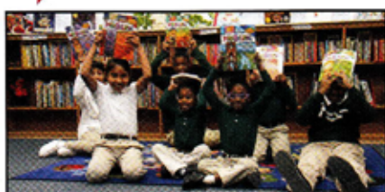
New religion books - We Believe!

A strong culture blends respect, Catholic values, and peacemaking skills. We begin and end our day gathered in prayer, giving thanks for our students, staff, and community. Fr. Carroll Mizicko, OFM, celebrates Mass with our students every week in our chapel, and students are always eager