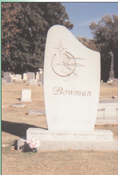
The family monument in Memphis, which marks the graves of Sister Thea Bowman, her parents and an uncle.