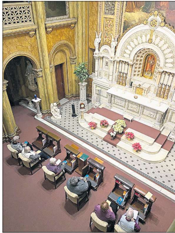
The Perpetual Adoration Chapel, located inside St. Rose Convent in La Crosse, Wisconsin, where the sisters pray daily from 6 a.m. to 10 p.m. for the needs of the world.